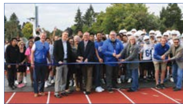
Hilhi's ribbon-cutting event took place on Oct. 3.

Inline gave Reedville special attention, getting crews to work extra hours and days. As fathers themselves, they knew the importance of providing students and staff a safe, modern campus for a great start to the school year. For its efforts, the District recognized Inline at the Fall Summit on Oct. 19. Mooberry Elementary improvements are next for Inline.