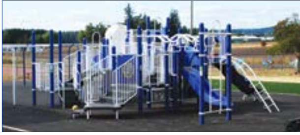
West Union Elementary's new playground