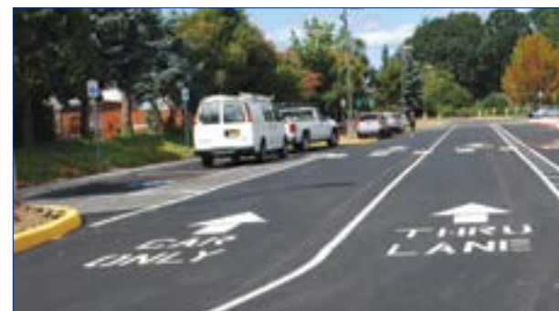
Eastwood's new bus dropoff area

These new resources not only benefit student athletics and activities, but also provide recreational opportunities for the broader community. The Hillsboro Hops' $300,000 donation toward the Hillsboro Hops Youth Field (at the southwest corner of Glencoe's field) will provide needed space for youth baseball and softball. Ribbon-cutting ceremonies to commemorate the opening of the school fields were held on Oct. 3 for Hilhi and Oct. 15 for Glencoe. Watch for the official dedication of the Hillsboro Hops Youth Field to come in spring 2019, in time for opening day for youth leagues.