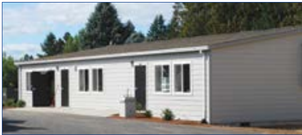
McKinney's three-classroom modular building

In addition to Reedville, playgrounds were updated at Butternut Creek, Farmington View, W.L. Henry, and West Union Elementary Schools to replace aging structures. The new playgrounds have ADA-compliant equipment, rubberized tiles for added safety, and synthetic turf play areas for all-weather use. All playgrounds were completed before the start of school (some were already being tested out before then!).