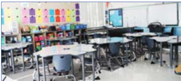
Farmington View's new flexible classroom furniture

Reedville's two portables were replaced by a five-classroom modular, which also includes a kitchen and cafeteria. (One of Reedville's portables was able to be salvaged and, along with a portable from Patterson, relocated to North Plains Elementary to provide additional student capacity until the new elementary school in North Plains is built.) Due to external delays, W.L. Henry's two-classroom modular is being installed as of press time, and is expected to be ready for occupancy by early November.